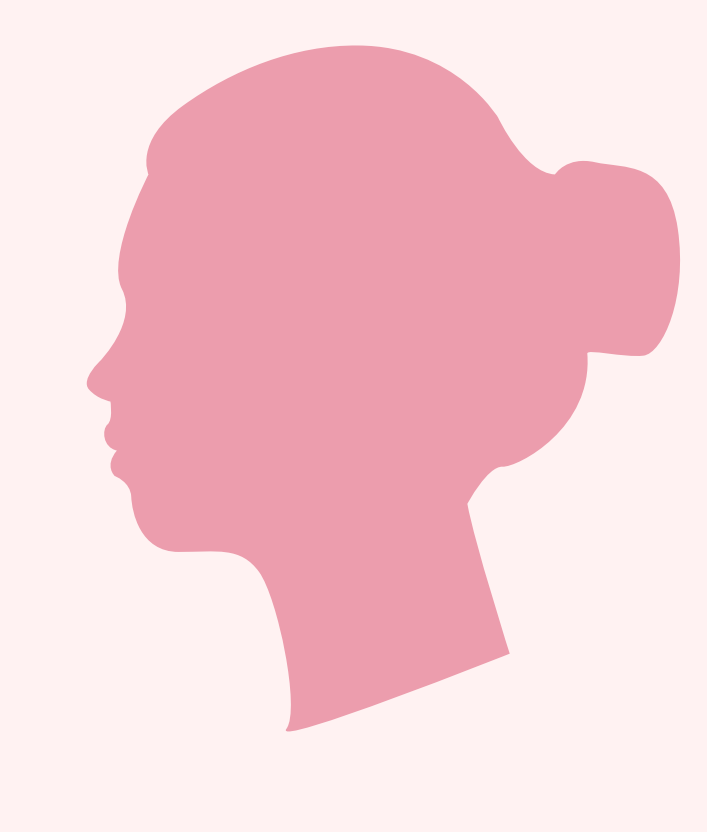
10 Women 6 are killed everyday.

Academics, NGOs, international bodies, and other actors have pressured Mexico for its failure to address the wave of ongoing human rights violations perpetrated specifically against women.